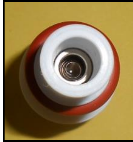
DS™ Connector Shown

Compare the supplied molded rubber boot (below left) with the industrial grade machined components included in the kit (below right). The kit is fitted with a plated machined connector with a double spring (DS™) retention system.