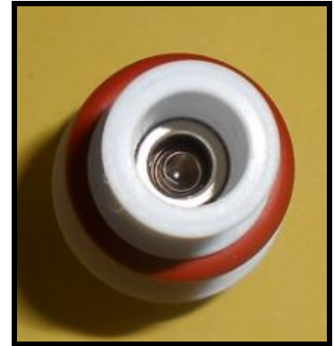
DS™ Connector Shown