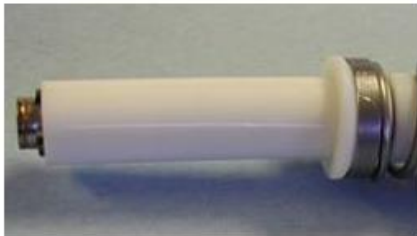
ARP670 Type 5M