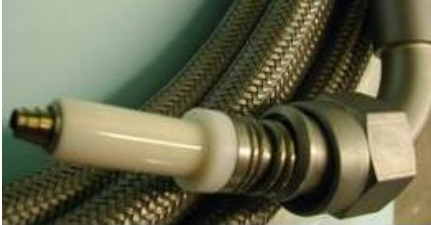
ARP670 Type 1M