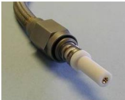
ARP670 Type 3M